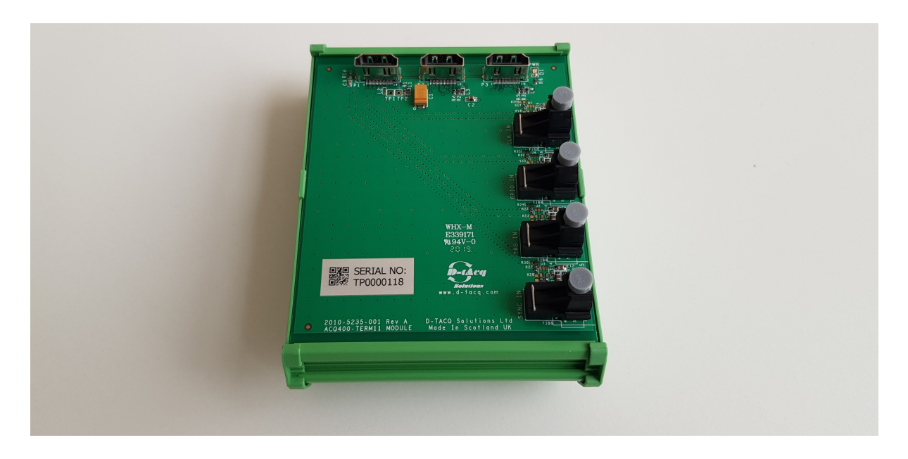
Fig1. Image of the ACQ400-TERM11 Module fitted with "Versalink" fibre optic connectors installed in an 88mm wide DIN rail carrier.

Up to 200 metres @ 10 MBd and 120 metres @ 50 MBd with 200um PCS.